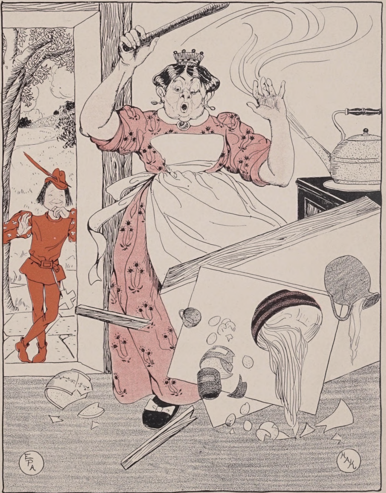
THE BAD EFFECTS OF JACK, JUNIOR'S MAGICAL BEATER